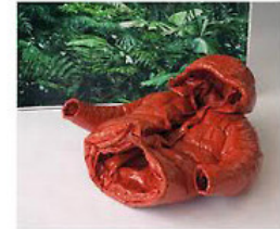
Explorer Resin, plastic, varnish, 88 x 82 x 42cm, 2013

"In the future anything could happen. I might form a Superart-Superkart team or make a documentary about Southeast Asian rainforests. But whatever happens, I'll spend most of my time exploring the processes of making art and experimenting with high-tech and traditional materials."