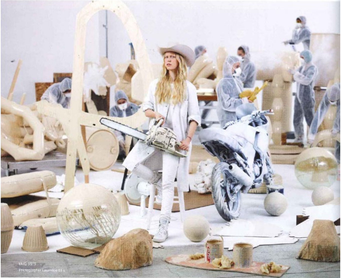
M:G 35'5